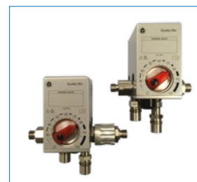
High/Low Air-Oxygen Mixer

Therapy Equipment Ltd, Unit 1, Cranbourne Avenue, Cranbourne Industrial Estate, Potters Bar, Herts. EN6 3JN