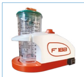
Portable Suction Device and Accessories